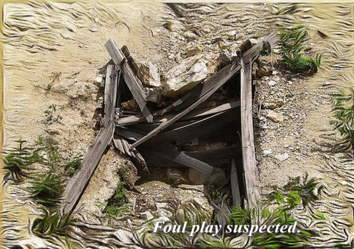
Foul play suspected.

Beloved 5th dwarf Grumpy has been killed as a result of a cave-in at the mining facility where he worked. Luckily, dwarfs 1 through 4 and dwarfs 6 and 7 were all finished for the day. It is unknown why Grumpy was working so late at night.