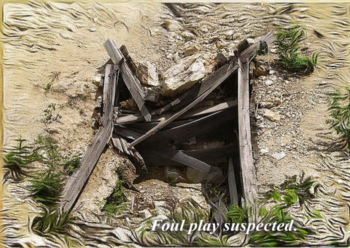
Foul play suspected.

Beloved 5th dwarf Grumpy has been killed as a result of a cave-in at the mining facility where he worked. Luckily, dwarfs 1 through 4 and dwarfs 6 and 7 were all finished for the day. It is unknown why Grumpy was working so late at night.