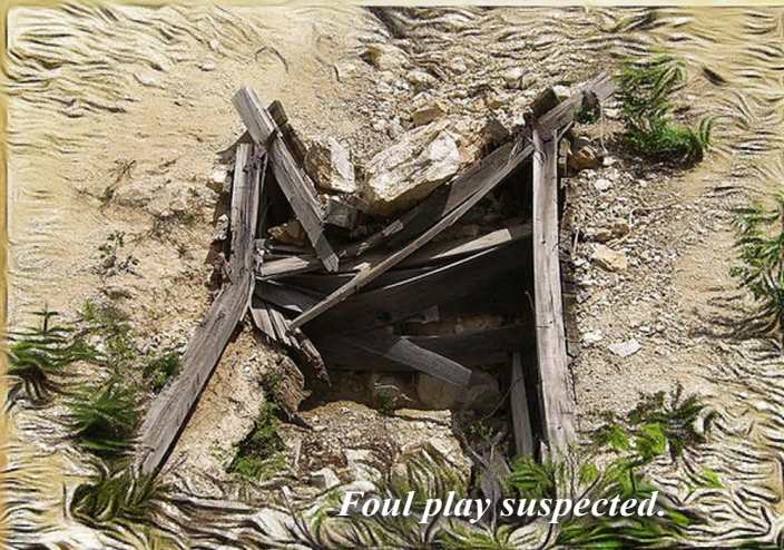
Foul play suspected.

Beloved 5th dwarf Grumpy has been killed as a result of a cave-in at the mining facility where he worked. Luckily, dwarfs 1 through 4 and dwarfs 6 and 7 were all finished for the day. It is unknown why Grumpy was working so late at night.